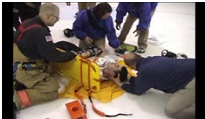
Seizure simulation scenario

SMC's proven process for developing |FLAWLESS| life-saving medical teams is unrivaled.